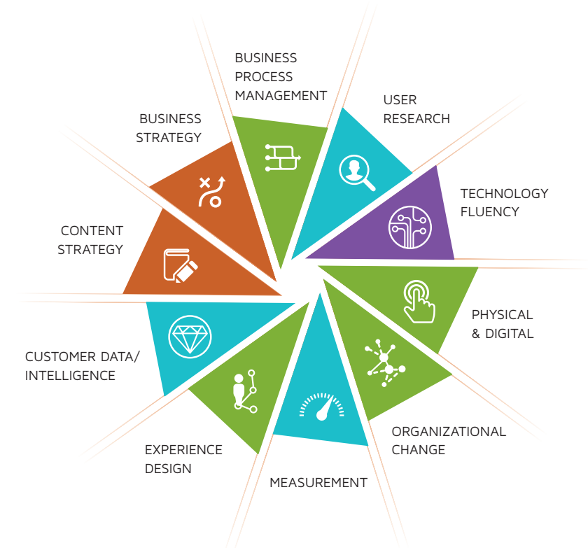
Figure 2 The Ten Core Competencies for Customer Experience Management

bring all resources to bear on 100% of projects. Within the CEM ecosystem, a diverse pool of service specialists is available to help address the challenges. Service providers with specific niche expertise, vendors’ professional services teams, digital agencies, and systems integrators are all viable options. Choosing a partner with the right expertise and capabilities is more important than the type of firm it is. The right service provider(s) can be the difference between an implementation’s success and failure, or the difference between getting the project done quickly and having it drag on unnecessarily. Making better use of service providers is, in fact, a key recommendation emerging from our research.